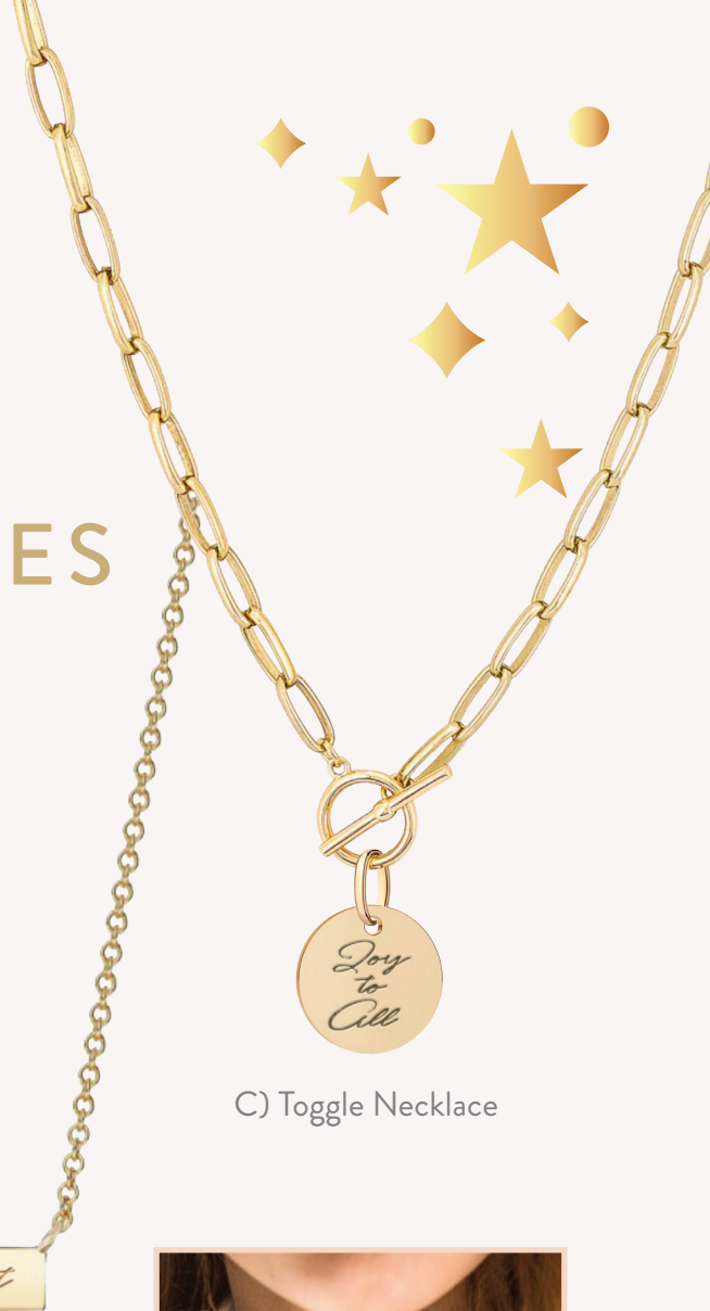
C) Toggle Necklace