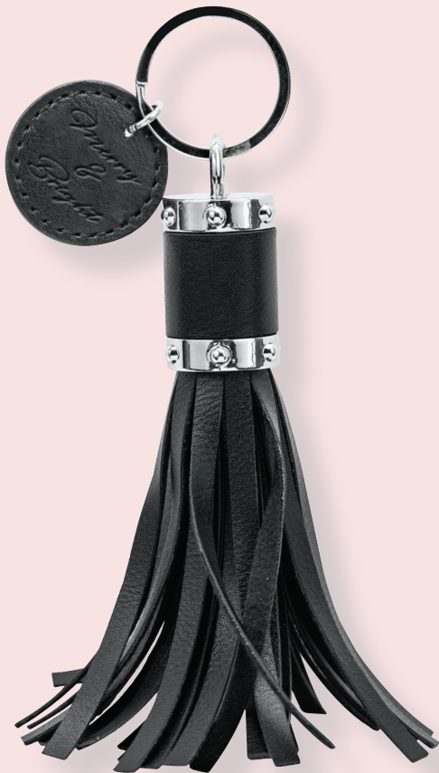
A) Tassel keychain