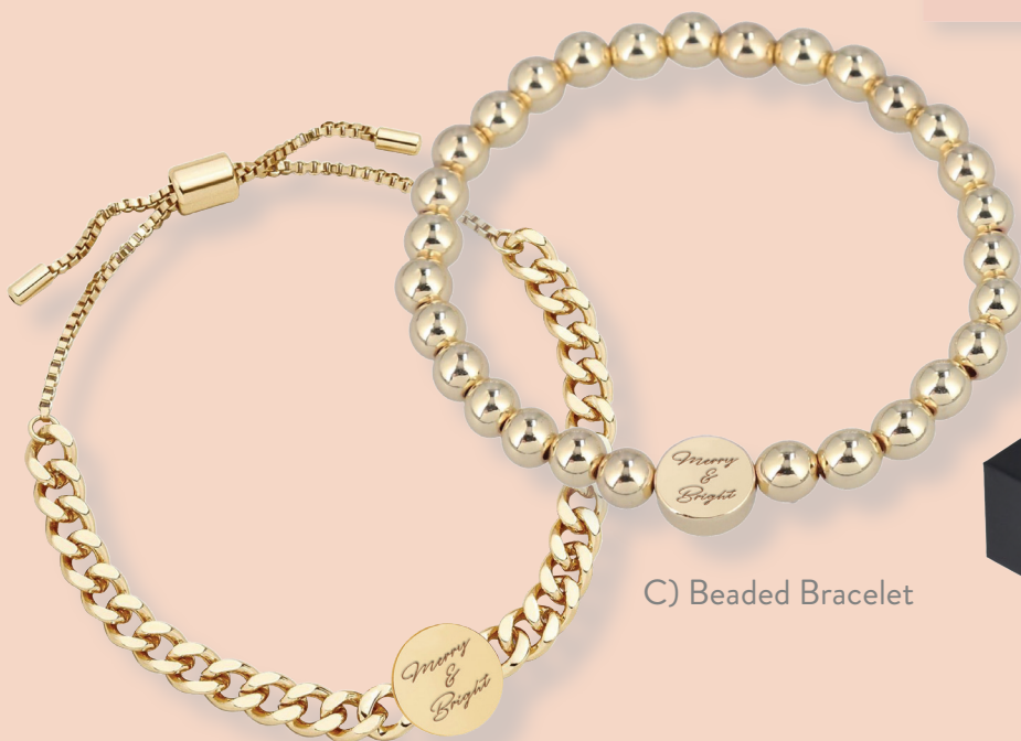
B) Adjustable Bracelet