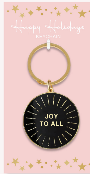
C) Starburst Keychain

Playful keychains are the perfect holiday gift!