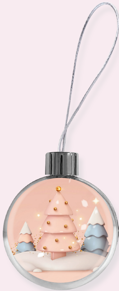
A) Domed Acrylic Ornament