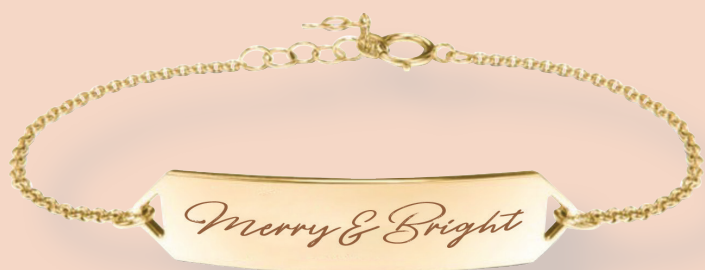
A) Plate Bracelet