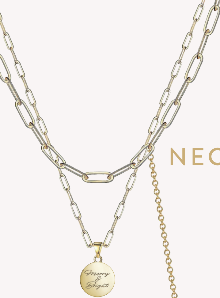
A) Multi Chain Necklace