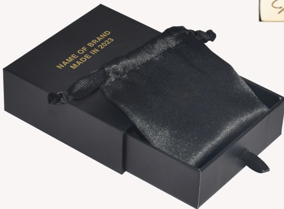
Box and Pouch Packaging