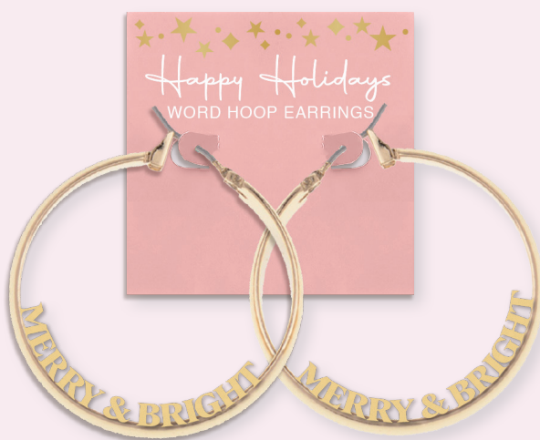
C) Word Hoop Earrings

Make a fun but elegant statement with these word hoop earrings. They can be customized with any word and your choice of font.