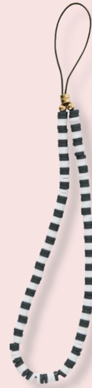
B) Friendship Bead Wristlet