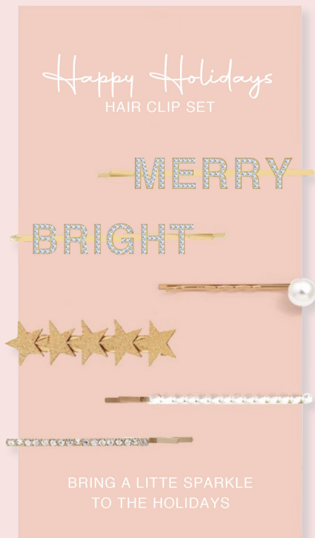
A) Hair Clip Set