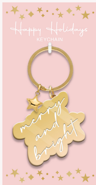
B) Playful Text Keychain