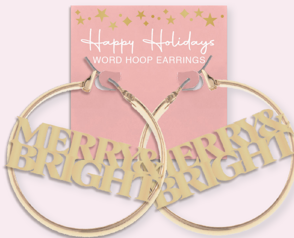
B) Hoop Earrings Bold Logo