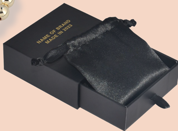
Box and Pouch Packaging

Customize a saying or shape that suit's your client's needs.