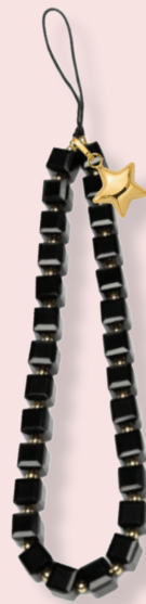
A) Glass Bead Wristlet