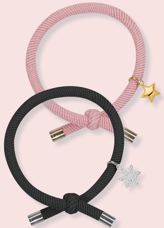
B) Hair Elastics with Charm

Add a decorative touch to your hair this holiday season. Whether it's a set of rhinestone hair clips or an elastic with a branded metal charm, hair accessories are the perfect way to add that extra sparkle.