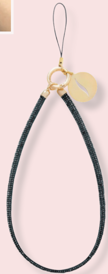
B) Sparkly Phone Wristlet

Avoid dropping your phone with these stylish phone wristlets. Add a custom charm with your client's logo.