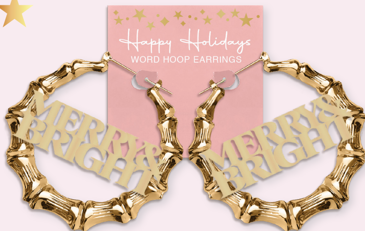
A) Bamboo Earrings