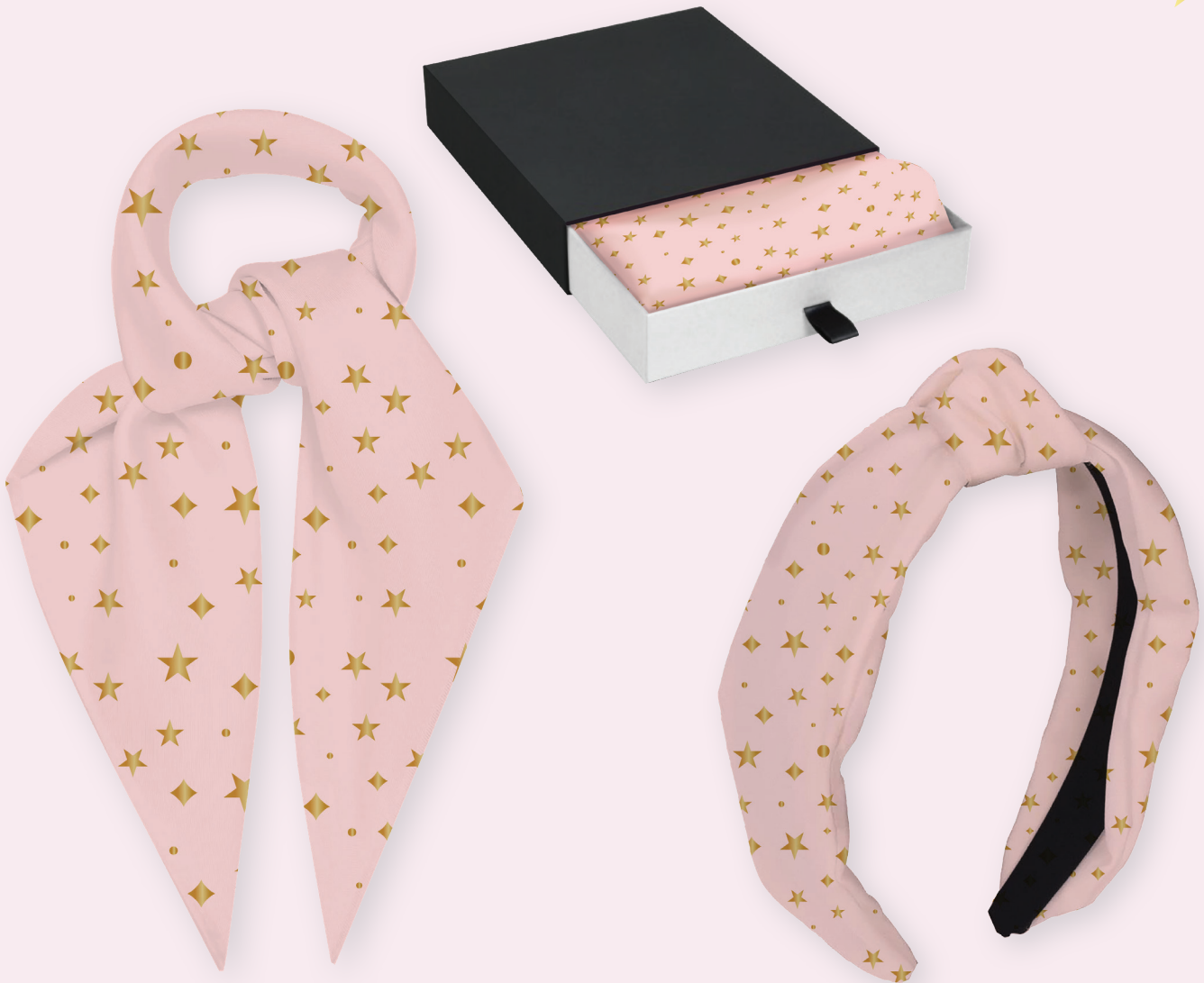
A) Scarf and Box