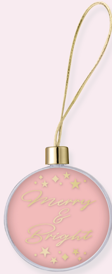
B) Flat Acrylic Ornament

Accessorize your tree in style with these beautiful acrylic bulbs. Incorporate any image in full color.