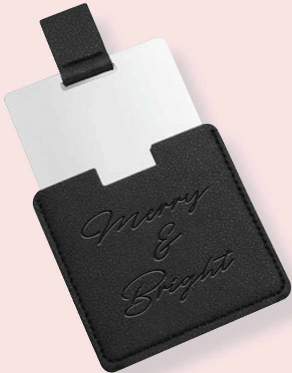
B) Mirror and case

These classy items are great additions for a company store or holiday gift program.