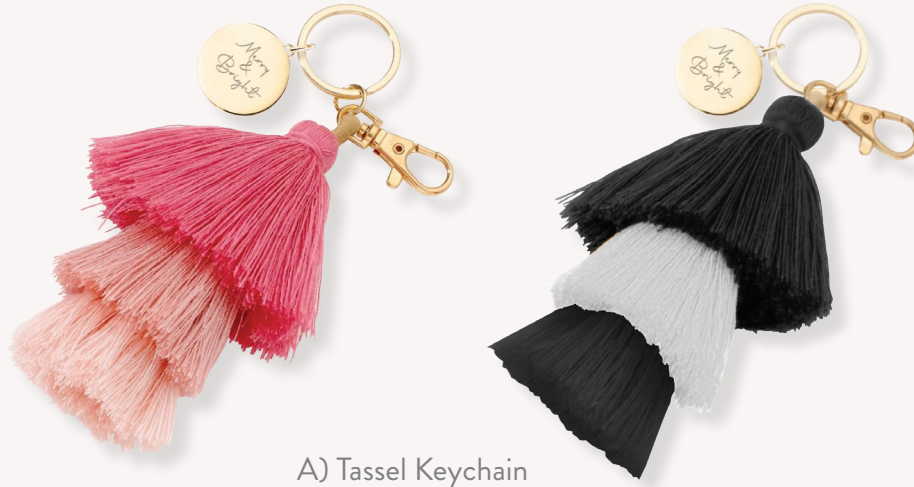
A) Tassel Keychain